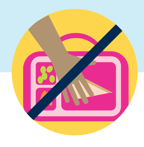
Don't share food with mates who have food allergy