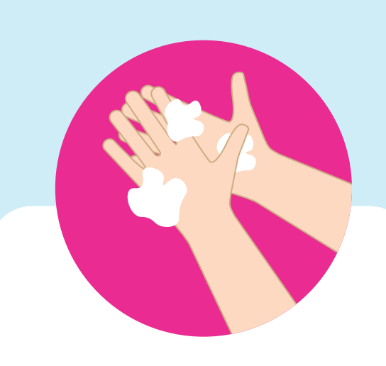
Wash your hands after eating